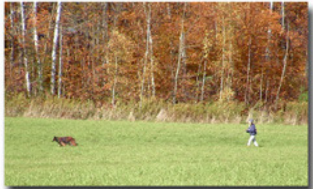
Noriko and Elle on their way to earning the TD. Unfortunately their TDX track was in such high cover and they were so far away from the gallery that I don't have any TDX tracking pictures.