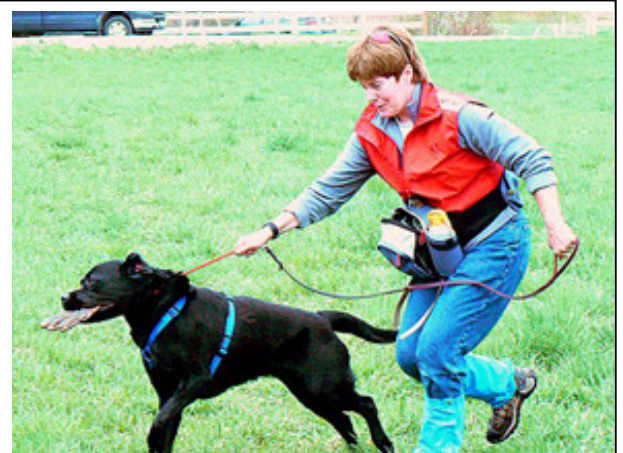
Our intrepid secretary with Baxter after earning their TDX in 2008 at Smokey House.

June 23: Club Meeting at 6:30 PM, Location TBD